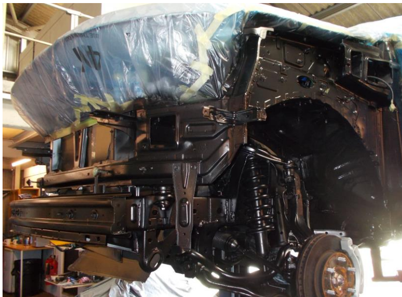
Rustbuster EM121 Epoxy is applied in two coats to all areas of the vehicle.