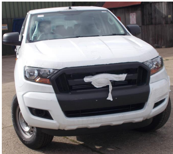
The brand new Ford Ranger arrives Rustbuster's Spalding premises

They called Rustbuster and this is the case history of what we did to provide protection to this vehicle. The RNLI have long been a customer of Rustbuster using our Rustbuster EM121 Epoxy coating on their sea tractors chassis, engines and equipment for over twenty years.