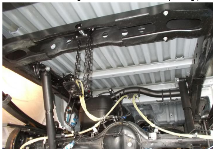
The underside is degreased and steam cleaned heat shields and exhaust are removed.