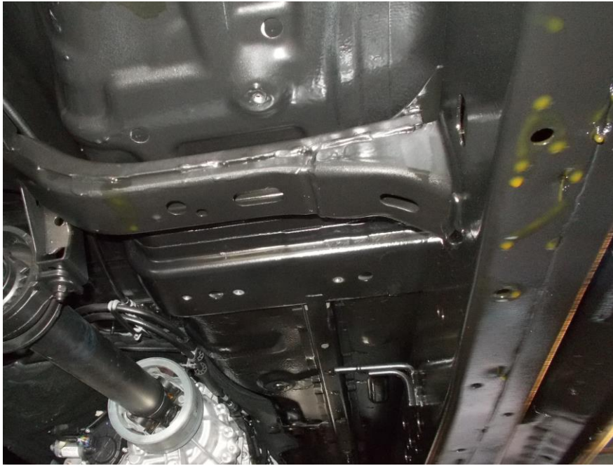
After the Epoxy is applied all of the cavities are injected with Rustbuster Classic Cavity wax