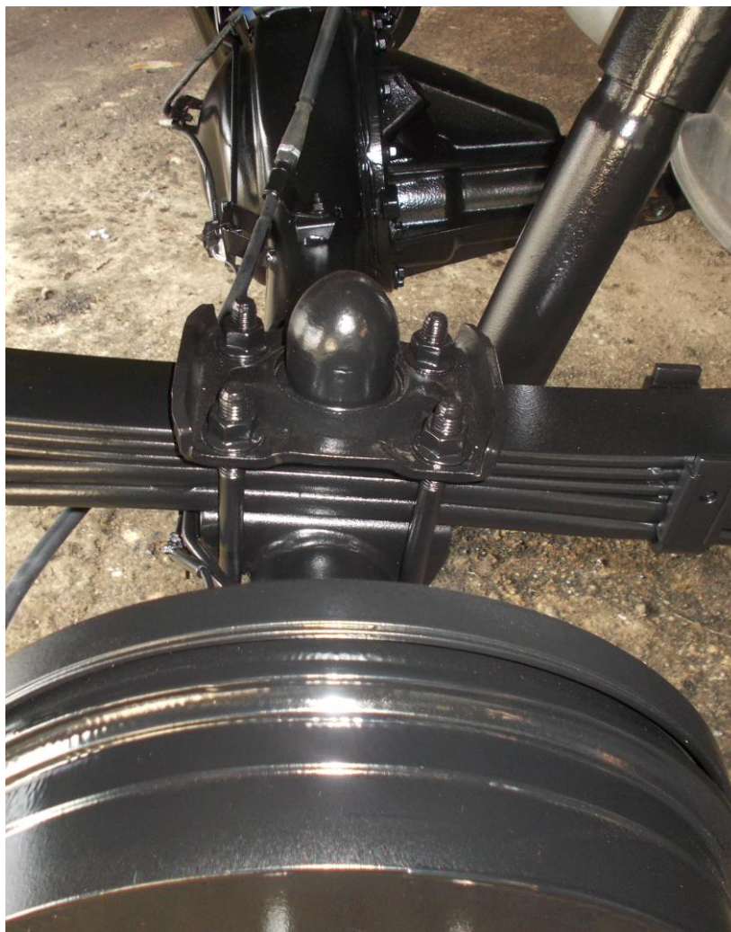
Brake drums springs the rear axle shock absorbers etc all coated in Rustbuster EM121