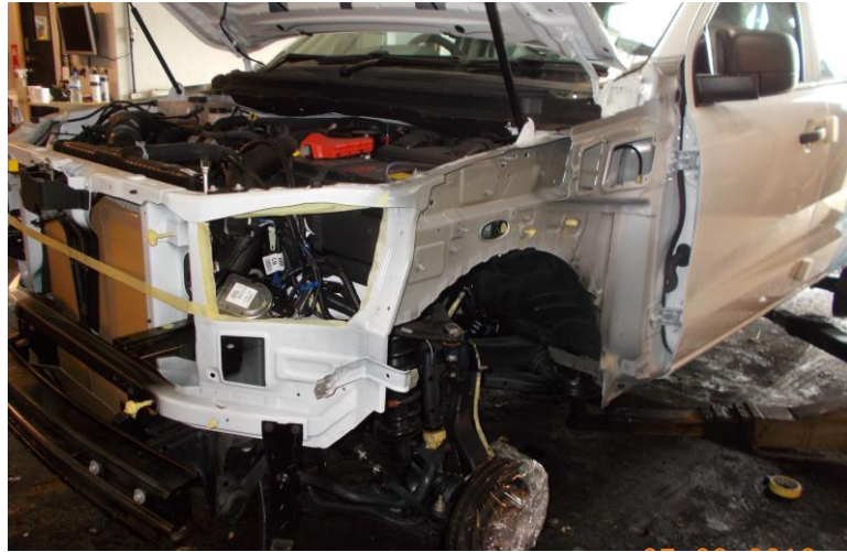
Bumpers, under trays, lights, wings and all plastic arch splash guards are removed