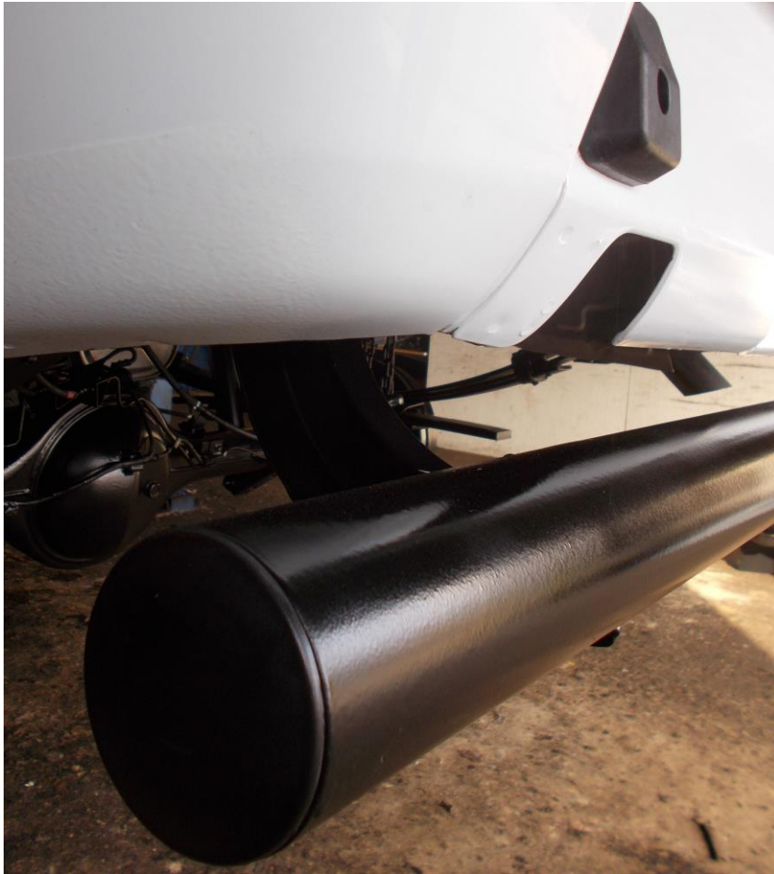
Rear bumper bar coated with Rustbuster EM121 Epoxy