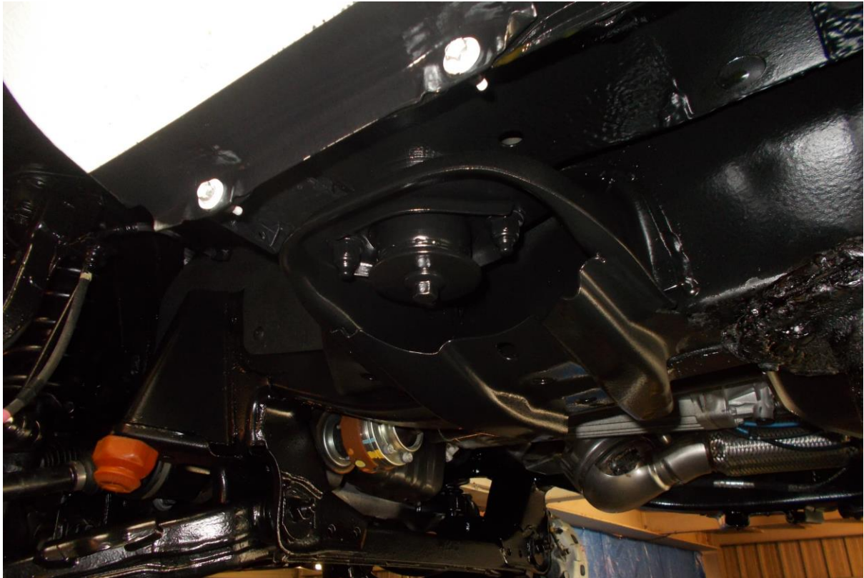
Body mounting points and sill bottoms coated in Rustbuster EEM121 Epoxy