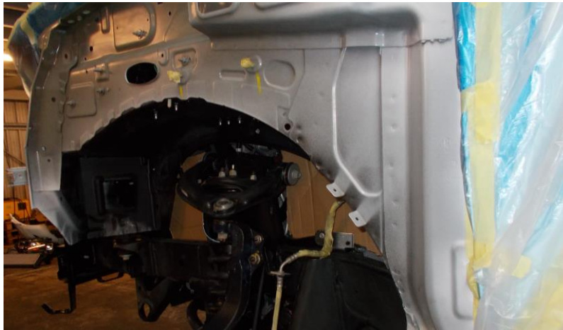
Body work is masked