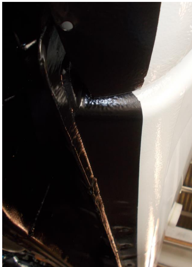
Sill bottoms and seams coated with Rustbuster EM121